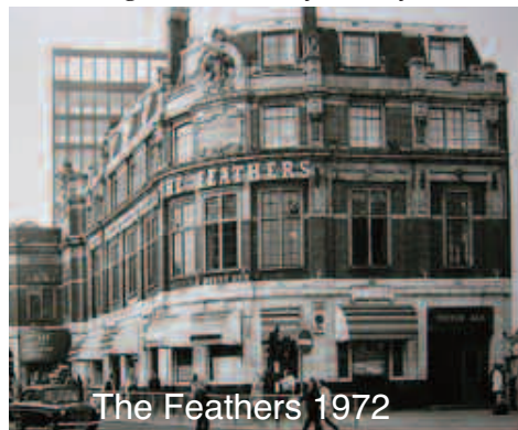
The Feathers 1972

The former Town House public house in the Broadway (site of the Feathers Coaching Inn) has been recently converted into flats above the ground floor. A new Metro Bank "shop" is due to open in June on the ground floor. We were approached about helping find an historic photograph of the locality which would be displayed in enlarged form in their new premises. We pointed them in the direction of the Ealing Local History library which has an extensive