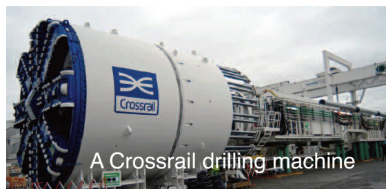
A Crossrail drilling machine