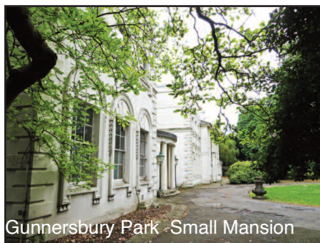
Gunnersbury Park - Small Mansion

Meanwhile there have been several very positive developments. Funding from Ealing and Hounslow Councils,